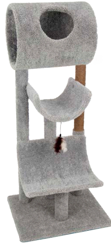
ASSEMBLED DIMENSIONS 24" X 20" X 54" (H)

• Vacuum your cat tree prior to initial use to remove any packaging debris.